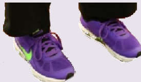
Of course-purple shoes