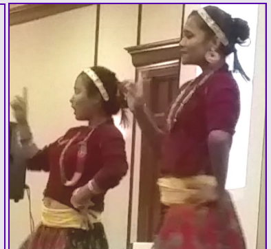
Women of Bhutan in song and dance.