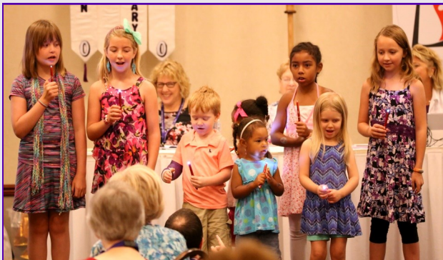
Beautiful children letting their lights shine!