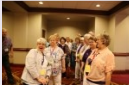
Those crazy EC members