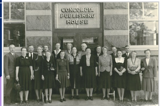
First Executive Board, 1942 taken in St. Louis, MO Concordia Publishing House