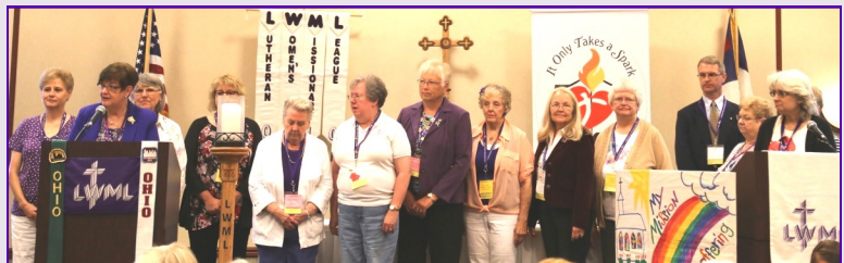
Candidates for office.